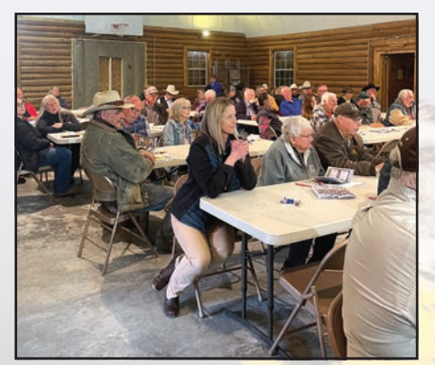
Members in attendance at the District 2 meeting in Shell.

budget session, highlighting the issue of crypto-mining and the legislature wanted to de-regulate some of the