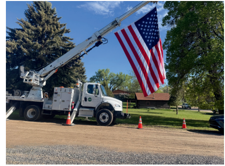
This year we had the American flag hanging on one of Big Horn's line trucks at every district meeting.