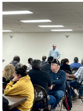
Members in attendance in Burlington.