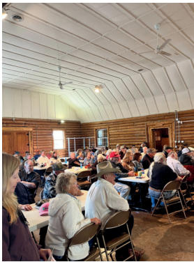
Members in attendance in Shell.