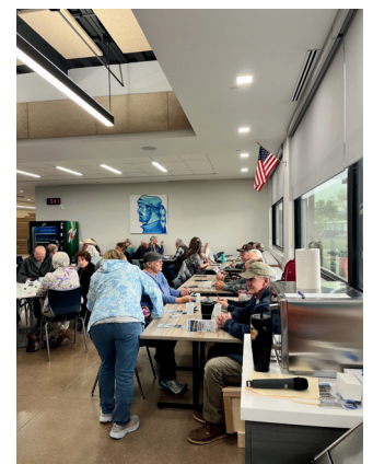
Members in attendance in Ten Sleep.