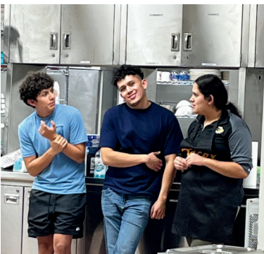
Pictured is our caterer's kids waiting to start serving.